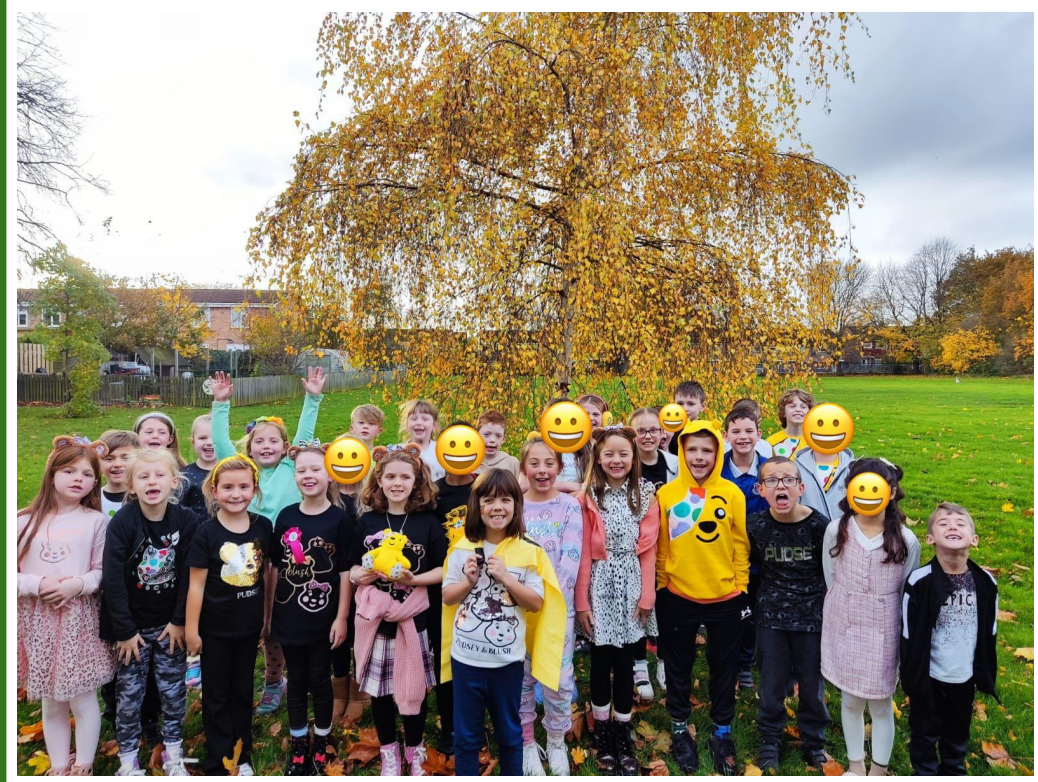
What a busy half term it has been in Rowan!

We have really enjoyed our learning this half term, especially in Science and Art. We learned all about our digestive system, including the role of each tooth type and the journey our food takes through our body!